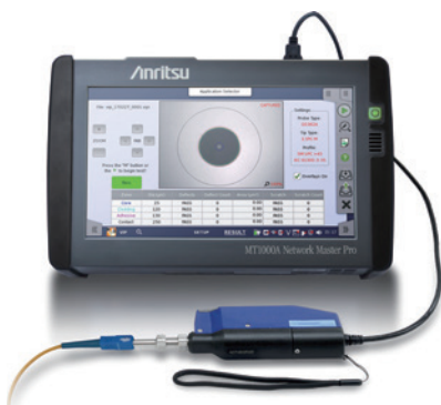
Available for MT1000A and MT1100A *Shown with MT1000A